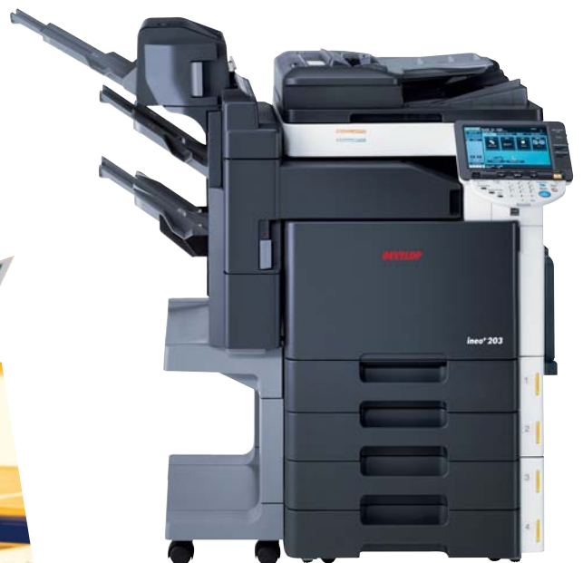
ineo+ 203 with document feeder (DF-611), embedded finisher (FS-519), saddle kit (SD-505) and 2x universal tray (PC-204)