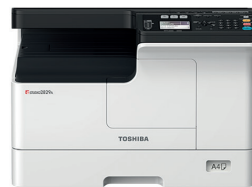
Paper Feed Unit