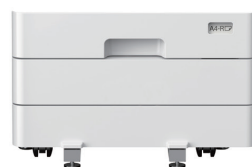
Paper Feed Pedestal