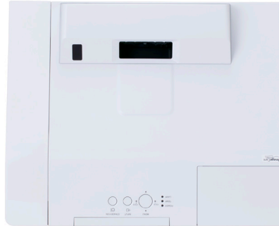
Top View (with cable cover)