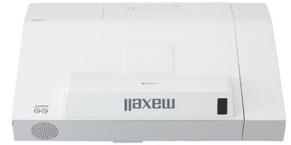
Front View (with cable cover)