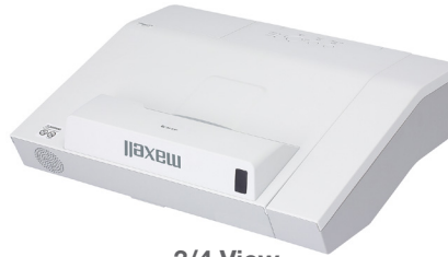
3/4 View (with cable cover)

resolution, the MC-AW3506 provides the perfect compatible solution. It also features a high contrast ratio, long lamp life, cloning function enabling you to copy settings data from one projector to others of the same model, and is wireless presentation ready. Plus, embedded networking gives you the ability to manage and control multiple projectors over your LAN (scheduling of events, centralized reporting, image transfer, and email alerts). Best of all, the high performance MC-AW3506 is exceptionally reliable and offers a very low cost of ownership.